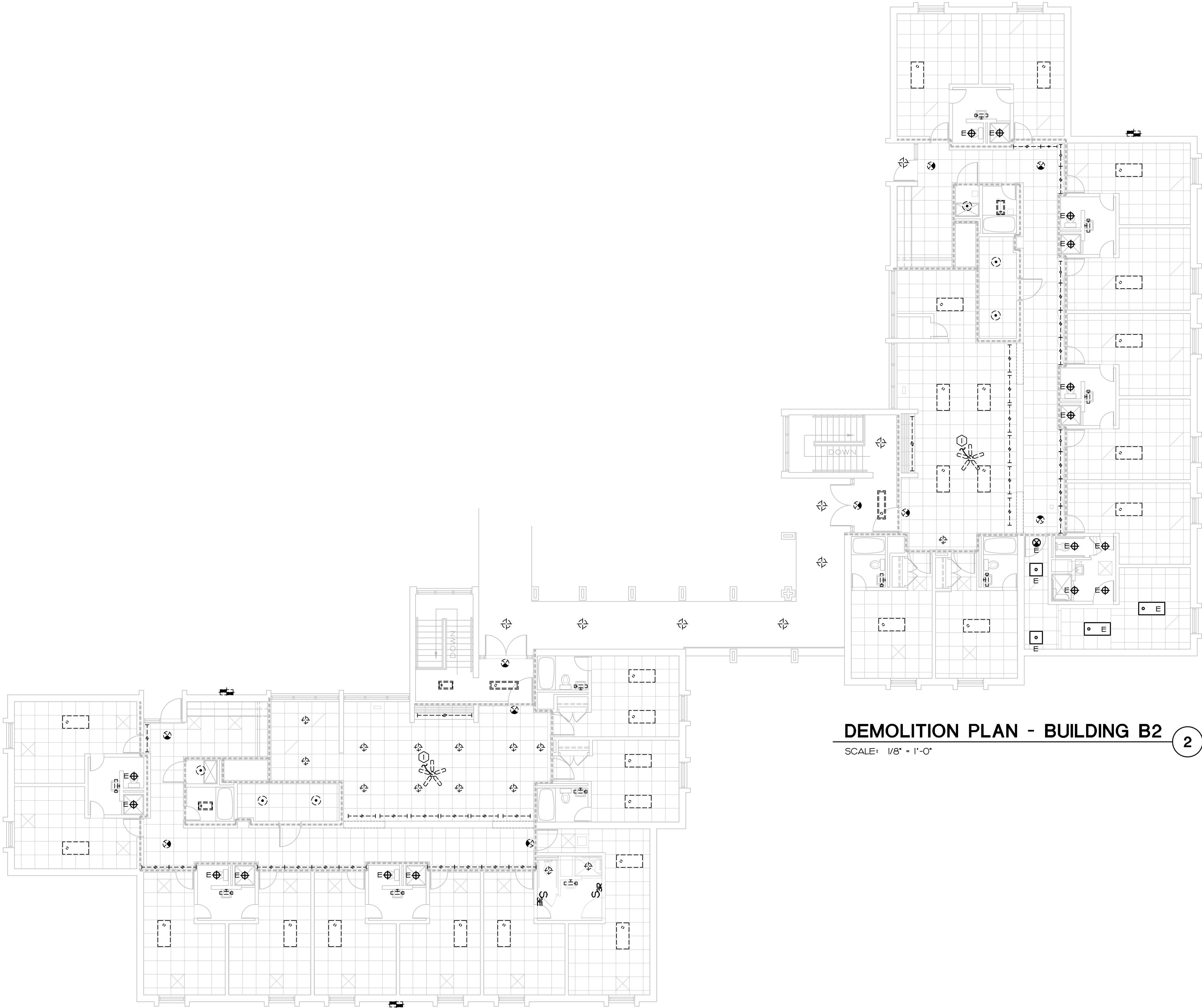
DEMOLITION PLAN - BUILDING A2

⬡ EXISTING FAN TO BE REMOVED AND REINSTALLED WITH NEW LIGHTING